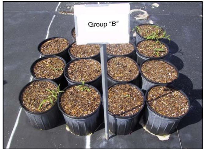
HERBICIDE B Weeds: 12