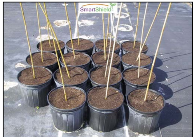
SMARTSHIELD Weeds: 0