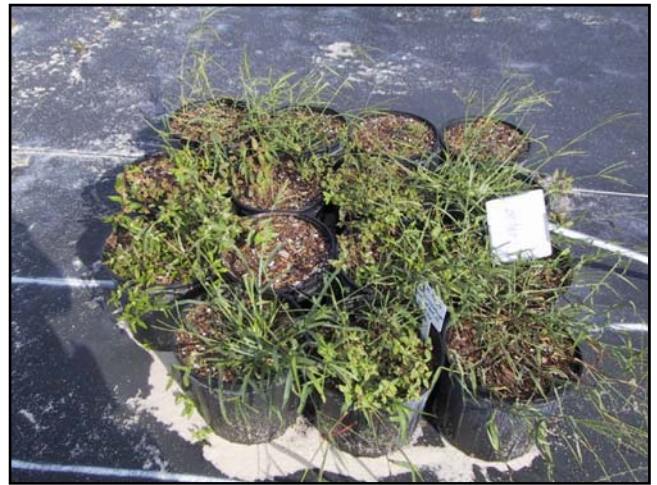
HERBICIDE B Weeds: 15