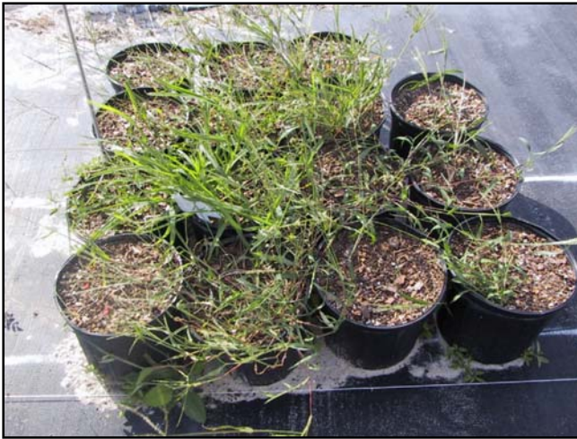
HERBICIDE A Weeds: 13