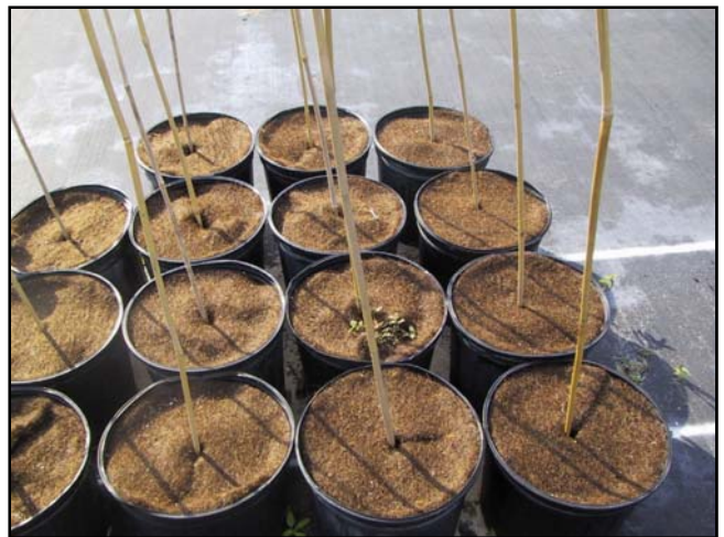
SMARTSHIELD Weeds: 1