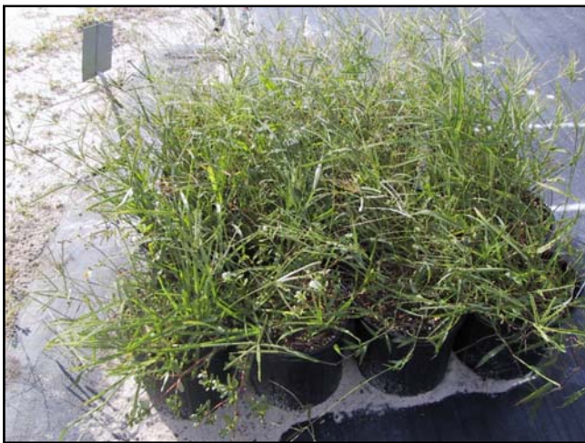
HERBICIDE C Weeds: 15